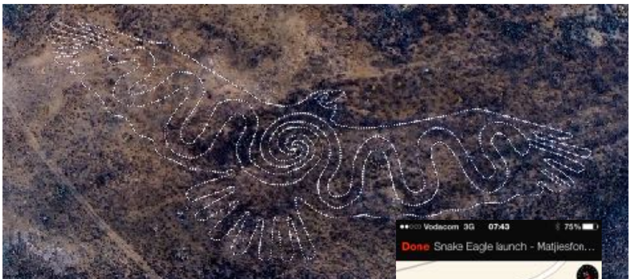
Snake Eagle Thinking Path @ Matjiesfontein 2014/15