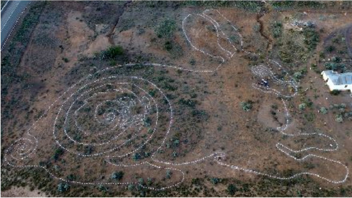
of the Riverine Rabbit Thinking Path, Loxton May 2016.