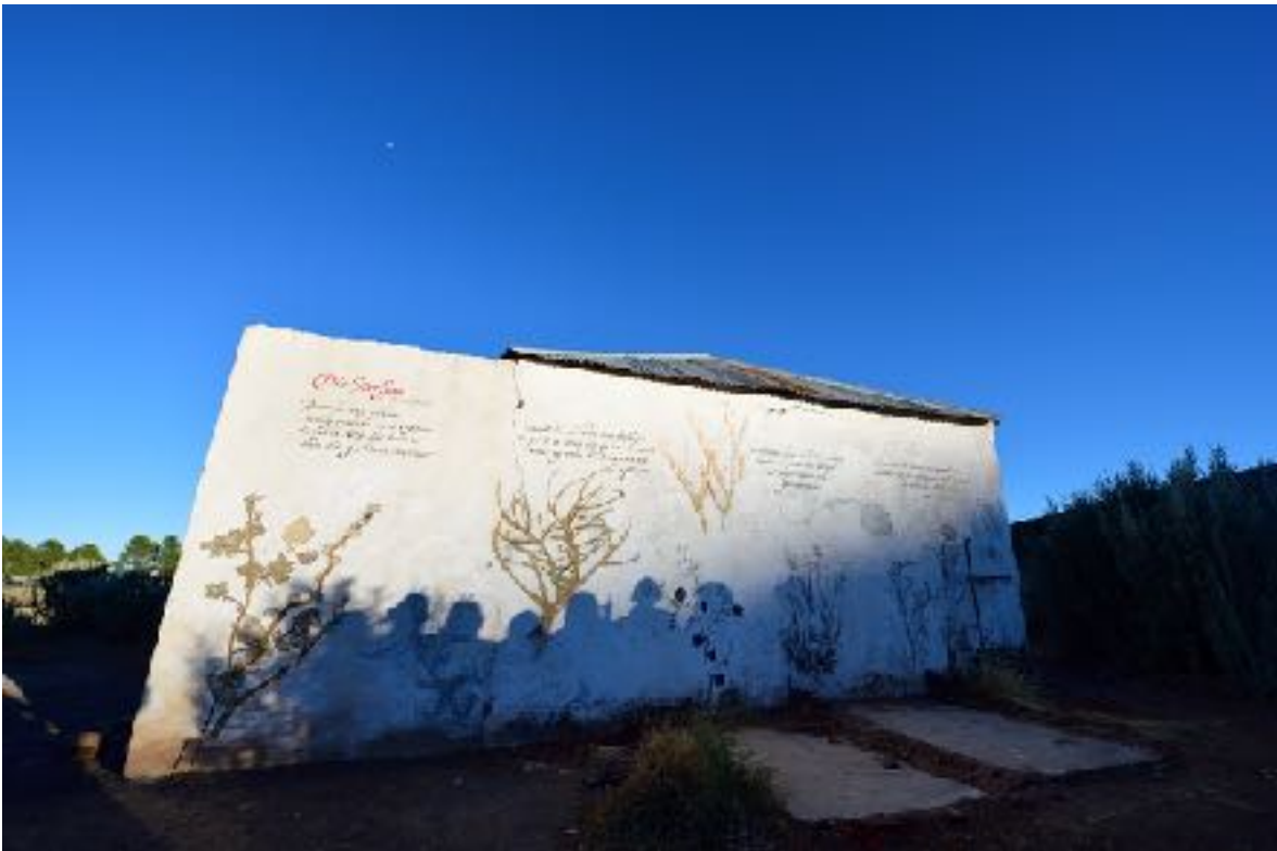
First light casts the shadows of the collaborators at the inauguration of the House of Time - a site specific installation at the Riverine Rabbit Thinking Path in Loxton. April 2017.