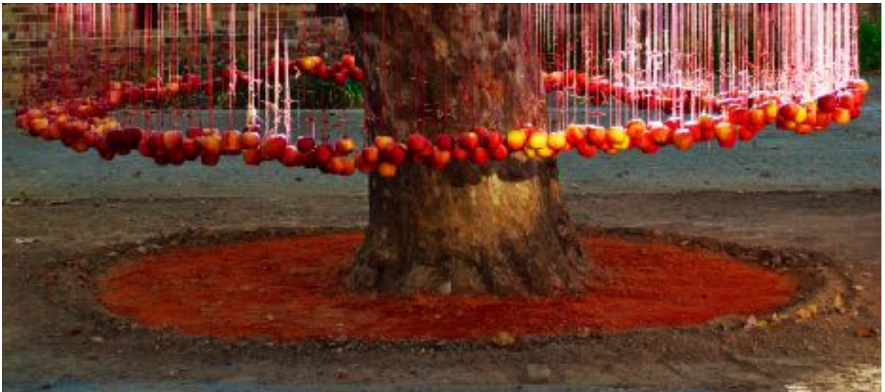
Tree of Knowledge of Good and Evil ii @ Woordfees, Stellenbosch 2012