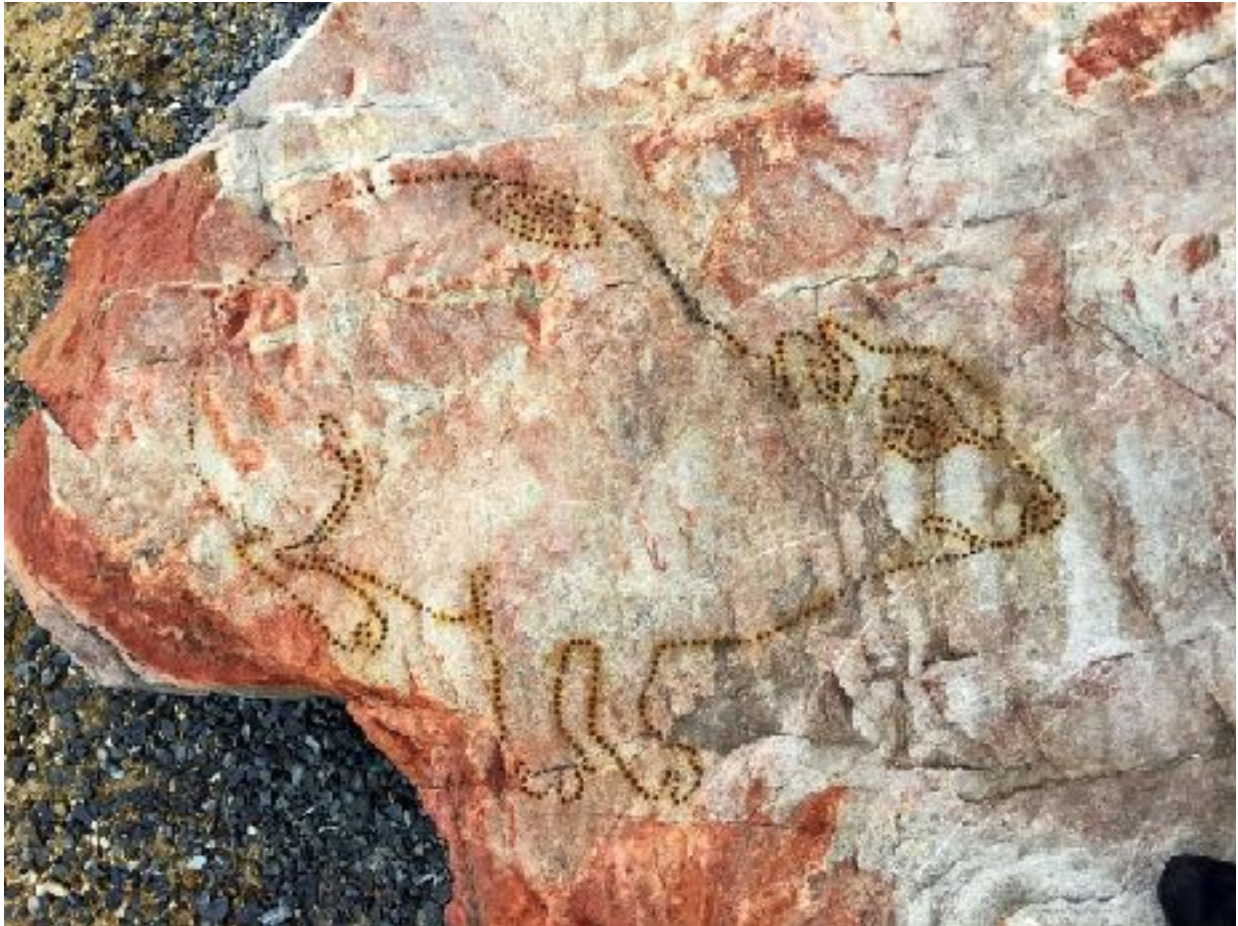
Dassie @ Hermanus Fynarts 2015