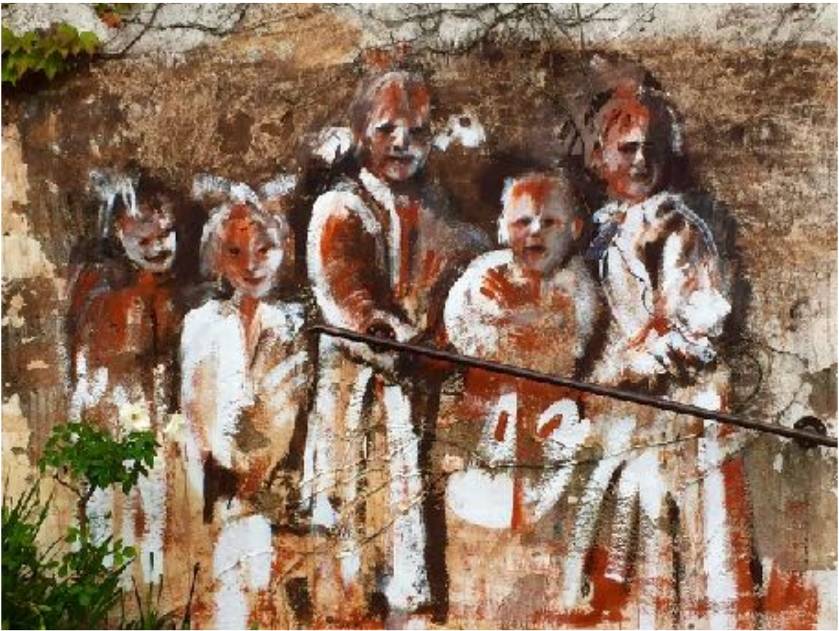
Daughters of Wildekrans by PC Janse van Rensburg 2015