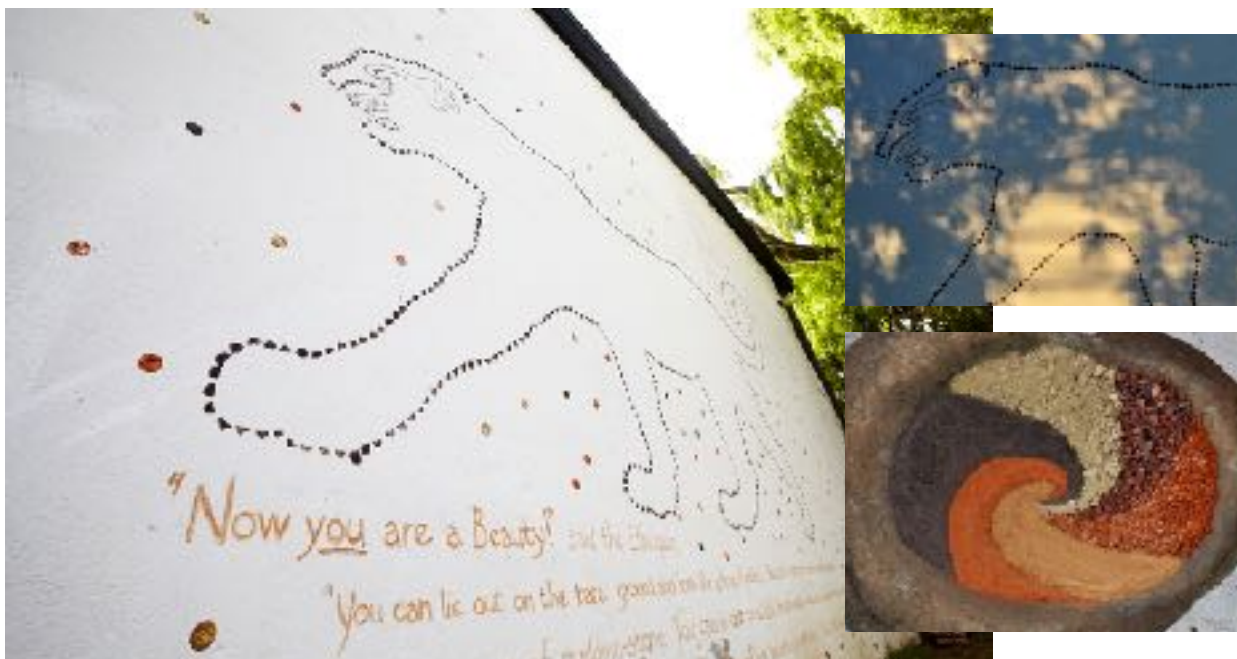
“Now You are a beauty” @ Wildekrans Country House for Elgin Open Gardens 2015 Inserts - leopard drawing at sunrise & locally collected natural pigment used to create the leopard and the paintings on the following page.