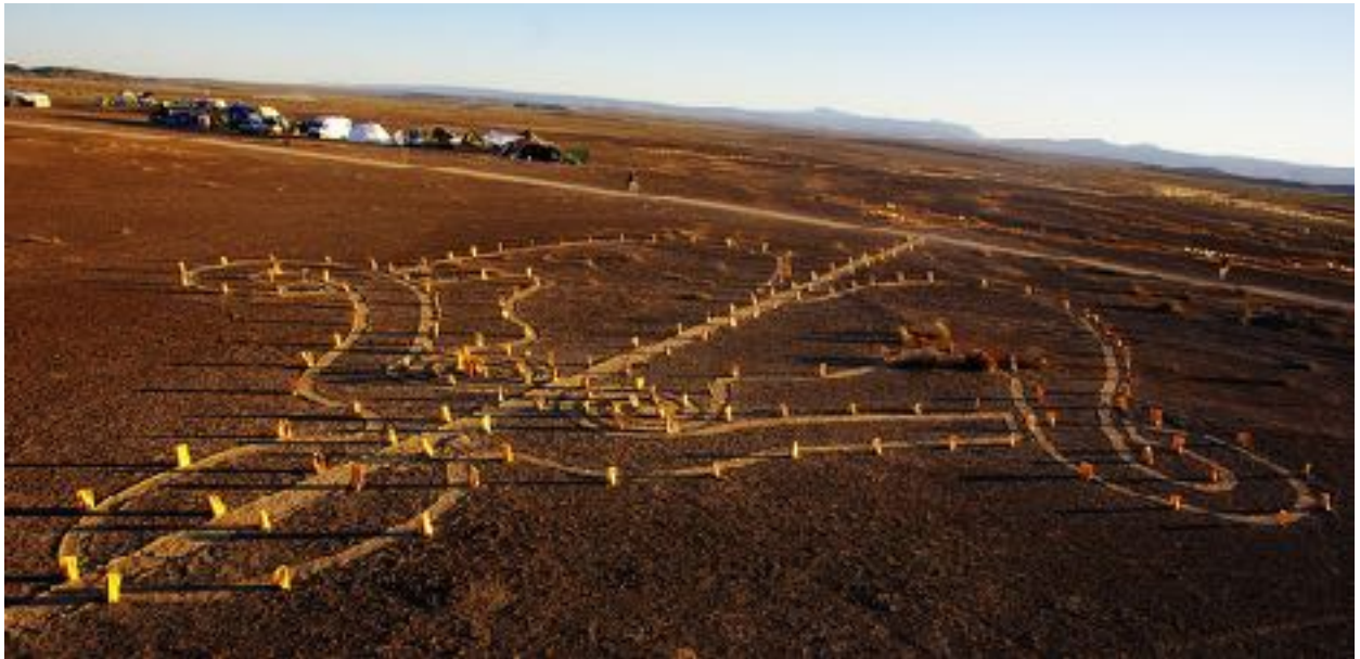
Earth Siren at Africa Burn in the Tankwa Karoo. 2009 & 2010