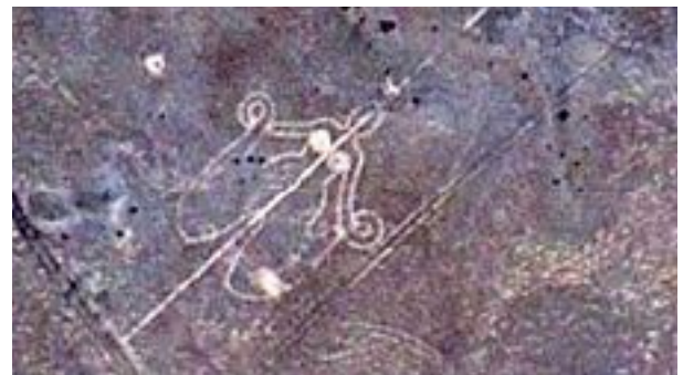
Screen shot of Earth Siren on Google Earth April 2010