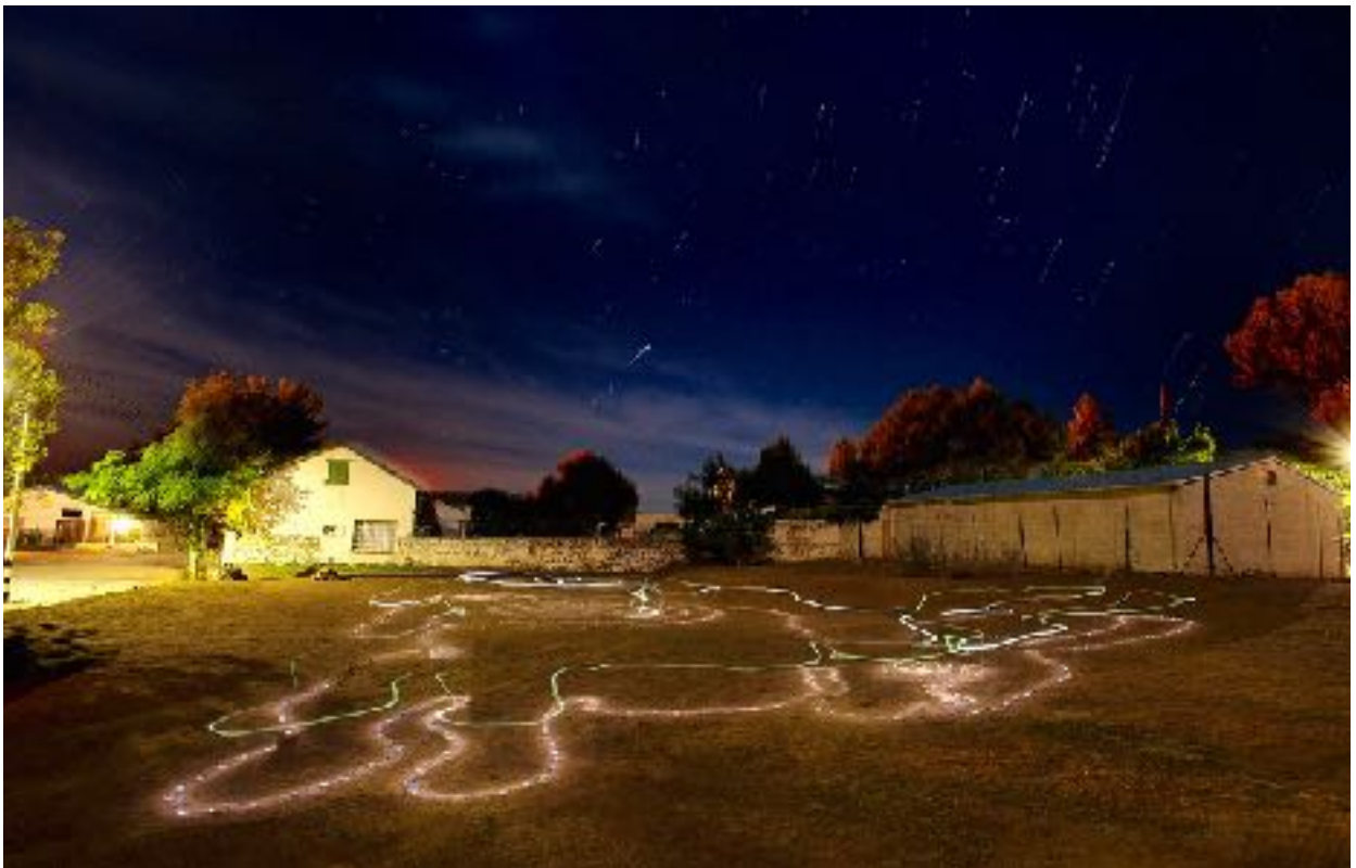
Riverine Rabbit Meander @ Boekefees, Richmond 2012