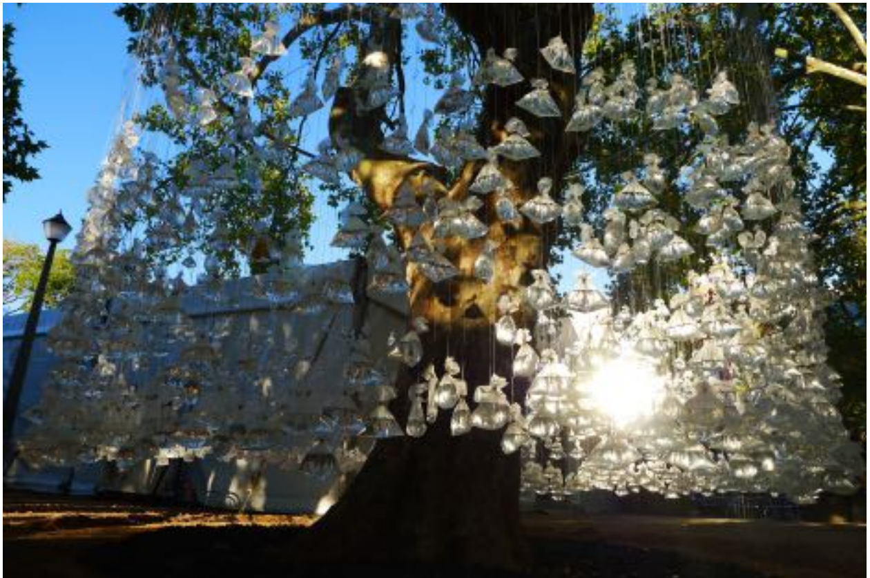
Tree of Knowledge of Good and Evil iii @ Stellenbosch woordfees 2013 - Photo: PC Janse van Rensburg